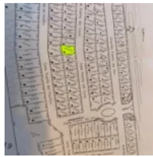
Lot 14 in Puerta del Mar for Sale