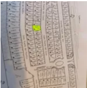
Lot 14 in Puerta del Mar for Sale