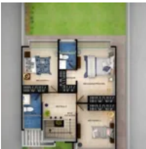
2-Story House for Sale in Amaralta Residencial, Rosarito