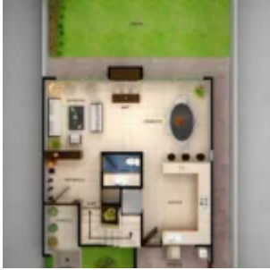
2-Story House for Sale in Amaralta Residencial, Rosarito