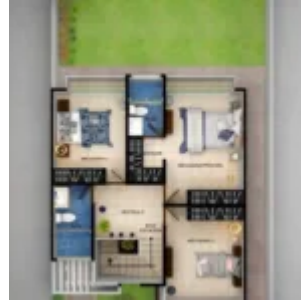
2-Story House for Sale in Amaralta Residencial, Rosarito