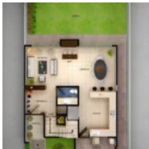
2-Story House for Sale in Amaralta Residencial, Rosarito